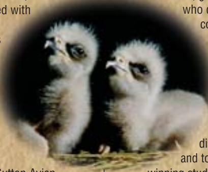
The Sutton Center has been featured in dozens of regional, national, and international publications.

Public Service Company of Oklahoma Riggs, Abney, Neal, Turpen, Orbison & Lewis